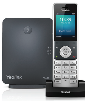
YEALINK W60B: Wireless Conferencing Solutions