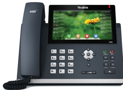
YEALINK SIP-T48U: High Level Full Color Display