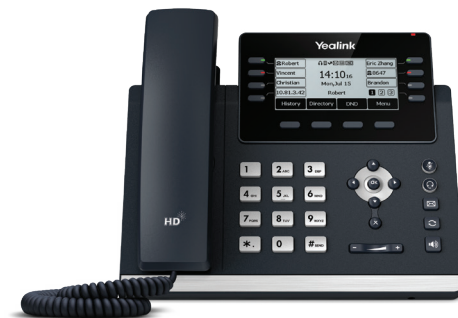
YEALINK SIP-T43U: Entry Level Program With Ease

FMTC features Yealink IP phones to power your business. Yealink is a global leader for enterprise communication handsets.